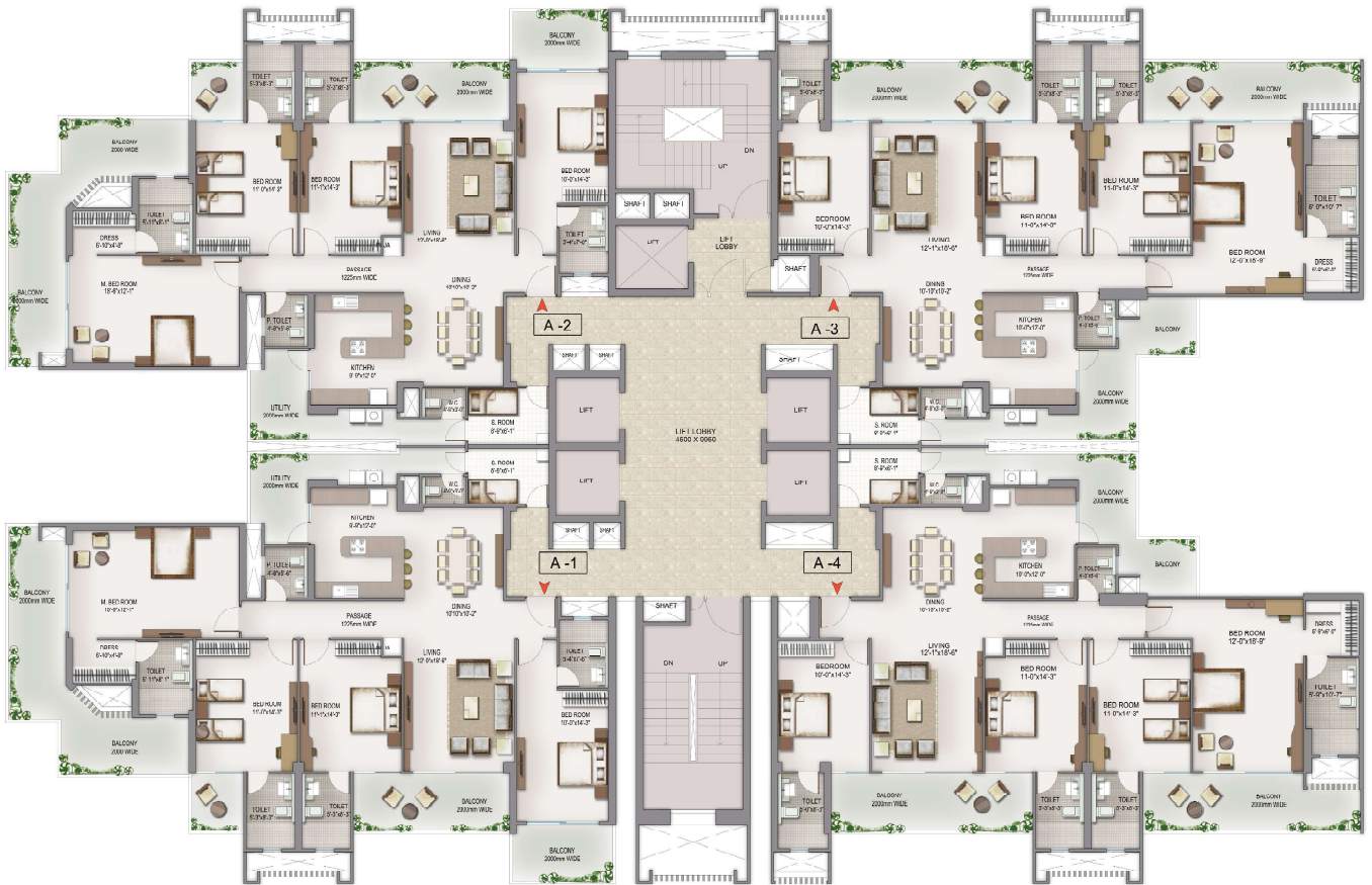
TYPICAL FLOOR PLAN (2ND-12TH FLOOR)