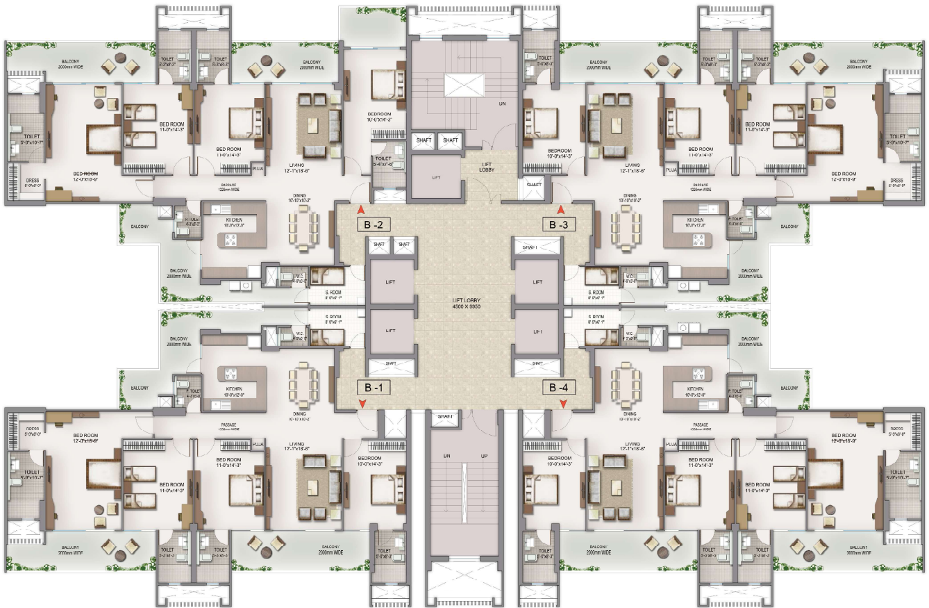
TYPICAL FLOOR PLAN (2ND-12TH FLOOR)